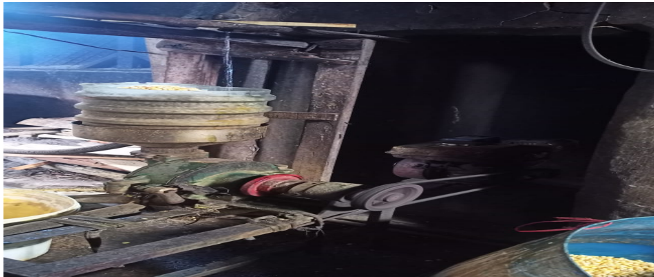
Figure 2b. Soybean milling process