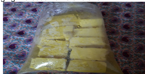
Figure 2h Tofu in non-branded plastic bags and ready for sale