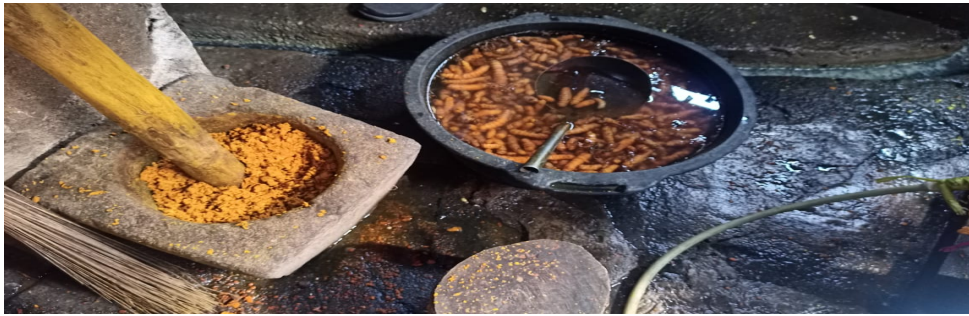
Figure 2f. Natural color turmeric for tofu