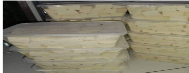
Figure 2i Tofu in a plastic box and ready for sale

The second solution is neat product packaging that provides a clean visualization of the products purchased, especially food products. This is in line with the explanation of Theopilus, Damayanti, Yogasara, & Ariningsih (2018) where packaging that visually gives a clean impression is an important factor and can form a factor to buy. which are produced directly by partners and then sold directly with makeshift packaging. The following in Figure 2i is an example of tofu production that is ready to sell with branded and more attractive packaging: