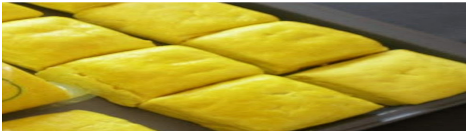
Figure 2g. Tofu ready to be packed and sold

Furthermore, after the presentation of the material and questions and answers regarding marketing development, namely the promotion process via internet media, at this stage, a solution approach was carried out to the problems found by the PkM FEB Unpas team, namely that business actors or MSME managers of tofu craftsmen could add insight to develop businesses by providing new services in addition to the services already provided. also, gain a deeper understanding related to the method of marketing its products, both conventional marketing face-to-face directly between sellers of business actors or managers of SMEs, tofu craftsmen, and consumers or buyers, or by way of online. namely between the seller and the buyer does not have to meet at the time of the offer or sale.