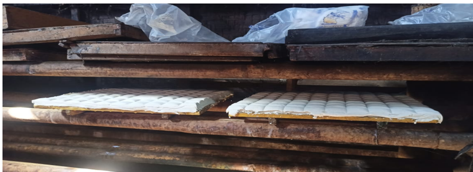
Figure 2e. Soybean porridge has been printed and will be colored