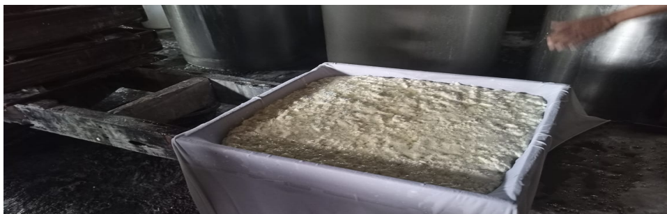
Figure 2d. Soybean porridge has been filtered ready to pres and print