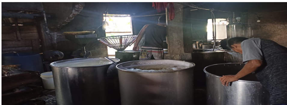
Figure 2c. Soybean porridge ready to filtered