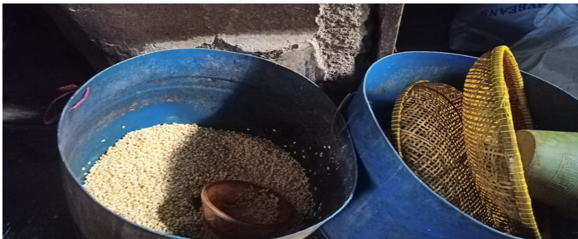
Figure 2a Soybean ready to grind

After the PkM FEB Unpas team carried out training activities related to marketing and HR management for SMEs, tofu craftsmen in Mandalasari Village. It also explains the problems and strategies that can be done as a solution to the existing problems. The next step in implementing the activities of the PkM FEB Unpas team is to see the tofu production process. The partner area consists of several parts, so the question-and-answer process is carried out directly at the relevant production location points. In this section, the PkM FEB Unpas team can see the ingredients and production process of the tofu produced. Production-wise, the SMEs in Mandalasari Village are good and optimal tofu craftsmen by producing 21 tons of tofu per day. Quantitatively, this shows that the production capacity can support the sale of tofu in Mandalasari Village. Following in Figures 2a,2b,2c,2d,2e,2f,2g,2h, the production process of tofu at the point of production location is :