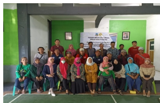
Figure 2j Marketing and HR development training for SMEs in Mandalasari Village Tofu craftsmen by the PkM FEB Unpas team