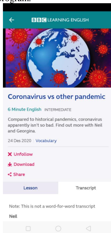
Figure 1. Minute English program on BBC Learning English.

There are some applications on the Smartphone which can be utilized for teaching and learning English. One of it is BBC learning English. The application sits on top of the platform stack and is the layer users interact with. According to Kuning (2020), BBC Learning English app teaches learners English through simple English conversations. It is from BBC News. BBC Learning English programs are 6 Minute English, English at Work, and so on. Here is the example of BBC Learning English program.