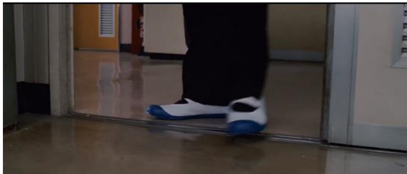
Figure SEQ Figure \* ARABIC 4