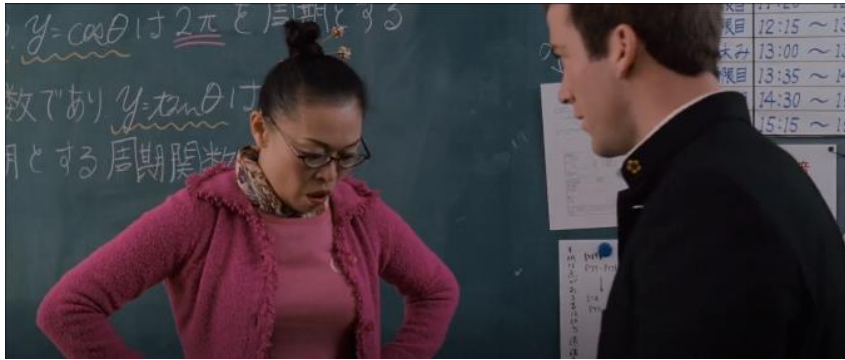
Figure SEQ Figure \* ARABIC 3