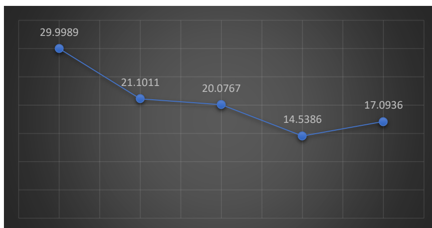
Figure 1: Data on the Value of Companies in the Basic and Chemical Industry Sector for the 2015-2019 Period