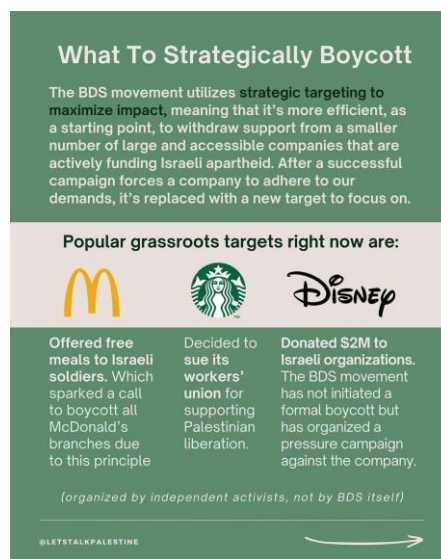
Figure 5 (Let's Talk Palestine, 2024)

To examine this datum, the writers divide this overwording textual message into six part; 1) What To Strategically Boycott , 2) The BDS movement utilizes strategic targeting to maximize impact, meaning that it's more efficient, as a starting point, to withdraw support from a smaller number of large and accessible companies that are actively funding Israeli apartheid. After a successful campaign forces a company to adhere to our demands, it's replaced with a new target to focus on , 3) Popular grassroots targets right now are: , 4) Offered free meals to Israeli soldiers. Which sparked a call to boycott all McDonald's branches due to this principles , 5) Decided to sue its workers' union for supporting Palestinian liberation , 6) Donated $2M to Israeli organizations. The BDS movement has not initiated a formal boycott but has organized a pressure campaign against the company , and 7) (organized by independent activists, not by BDS itself) . Apart from the textual message, the author put some symbols which are the logos of famous brands.