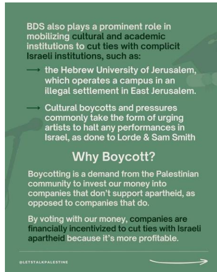
Figure 3 (Let's Talk Palestine, 2024)

Continuing the datum 2, this datum gives more information for the previous findings. Same as the previous finding (datum 2), in this slide (Figure 3), the author gives the importance of boycotting by providing two examples. The writers divided the textual messages of Figure 3 into five parts; 1) BDS also plays a prominent role in mobilizing cultural and academic institutions to cut ties with complicit Israeli institutions, such as; 2) the Hebrew University of Jerusalem, which operates a campus in an illegal settlement in East Jerusalem, 3) Cultural boycotts and pressures commonly take the form of urging artists to halt any performances in Israel, as done to Lorde & Sam Smith, 4) Why Boycott? 5) Boycotting is a demand from the Palestinian community to invest out money into companies that don't support apartheid, as opposed to companies that do, and 6) By voting with our money, companies are financially incentivized to cut ties with Israeli apartheid because it's more profitable.