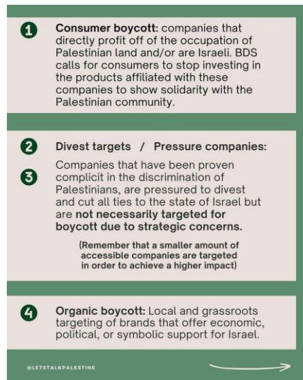
Figure 7 (Let’s Talk Palestine, 2024)

The figure 7 consists of full textual messages. The author gives numbers in each column to divide the message into four points. The writers decide to examine figure 7 based on the author's numbering pattern. In the first point, the author highlights the words ‘ Consumer boycott ’ which is followed by its explanation. The author uses the same words as the previous finding (datum 6) to present the further information. Differently, the author just put the highlighted words without adding any information like the first one. Oddly, the author put the explanation for the second point in the third point which has different highlighted words. The highlighted words in the third point indicate a caution to the readers and then also the author adds another highlight message below the third point. The fourth point has the same condition as the first point. The highlighted word ‘ Organic ’ means true target that should be stopped because the explanation supports the idea of the highlighted words. Overall, the whole sentences are in declarative form. It is because the author did not put any persuasive words to influence the readers to do something. Thus, this slide (Figure 7) can be said to be an informative slide.