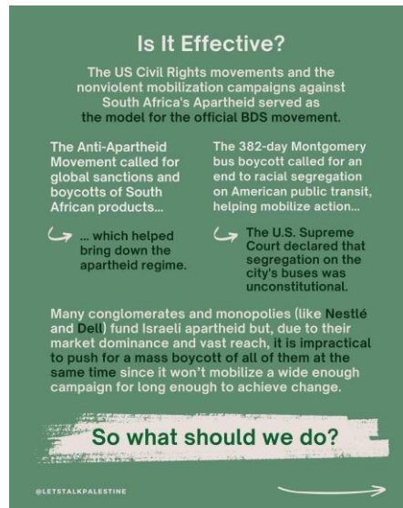
Figure 4 (Let's Talk Palestine, 2024)

In this datum, the writers examine this poster (Figure 4) by dividing the textual messages into eight parts; 1) Is It Effective? , 2) The US Civil Rights movements and the nonviolent mobilization campaigns against South Africa's Apartheid served as the model for the official BDS movement , 3) The Anti-Apartheid Movement called for global sanctions and Boycotts of South Africa products... , 4) ...which helped bring down the apartheid regime , 5) The 382-day Montgomery bus boycott called for an end to racial segregation on American public transit, helping mobilize action... , 6) The U.S. Supreme Court declared that segregation on the city's buses was unconstitutional , 7) Many conglomerates and monopolies (like Nestlé and Dell) fund Israeli apartheid but, due to tier market dominance and vast reach, it is impractical to push for a mass boycott of all of them at the same time since it won't mobilize a wide enough campaign for long enough to achieve change , and 8) So what would we do?