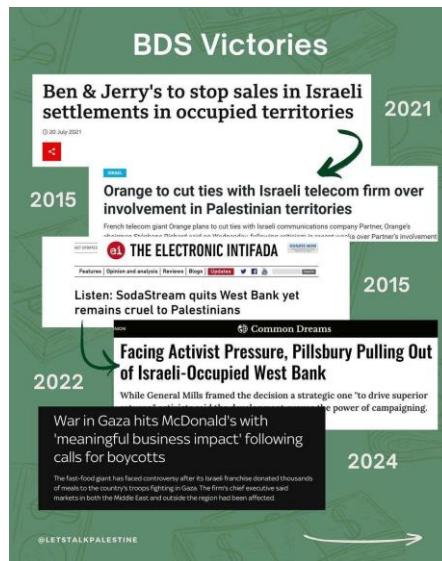
Figure 8 (Let’s Talk Palestine, 2024)

In this datum, there is only one text on the top of the slide, ‘ BDS Victories ’, which the author means giving some testimonies of the effectiveness of ‘ BDS ’ action. Through showing several screenshots of online news articles related to the effectiveness of ‘ BDS ’ action, the author tries to convince the readers to not doubt the effectiveness of ‘ BDS ’ action.