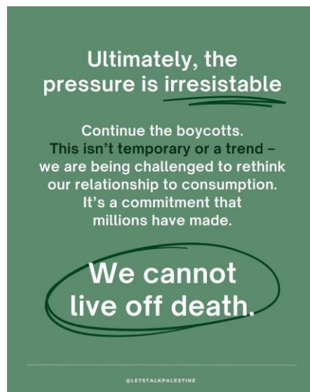
Figure 10 (Let's Talk Palestine, 2024)

In this figure, the author makes this slide full of textual messages. Thus, the writers examine this slide into three parts; 1) Ultimately, the pressure is irresistible , 2) Continue the boycotts. This isn't temporary or a trend - we are being challenged to rethink our relationship to consumption. It's a commitment that millions have made , and 3) We cannot live off death .