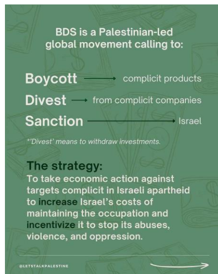
Figure 2 (Let's Talk Palestine, 2024)

The second slide (Figure 2) shows a full textual message in its content. Moreover,