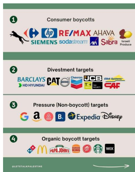
Figure 6 (Let’s Talk Palestine, 2024)

The datum six is dominated by many symbols instead of the textual message. The symbols itself serve as the target of the action that the author called for. For the textual message in this slide (Figure 6), the writers find four texts. Thus, the writers firstly divide the textual message in four text; 1) Consumer boycotts , 2) Divestment targets , 3) Pressure (Non-boycott) targets , and 4) Organic boycott targets . As can be seen, none of those texts can be said as a sentence because they do not satisfy the requirement to become a sentence. They serve as the label for the symbols below them. In the third text, the author mentioned ‘ Non-boycott ’ in parentheses gives clarification for the ‘ Pressure ’ word mentioned.