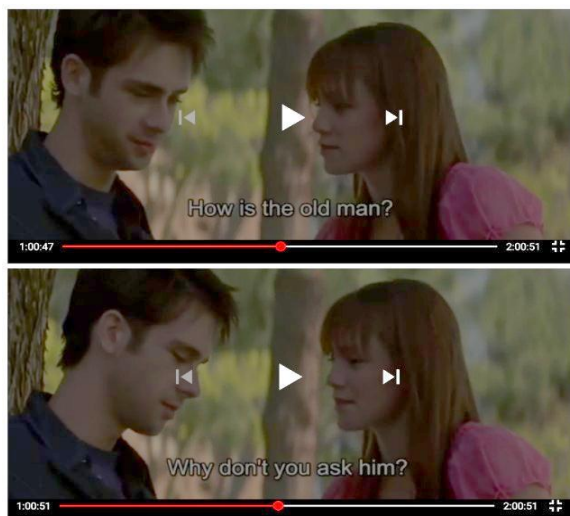
Figure 3. Scene in Dialogue 2