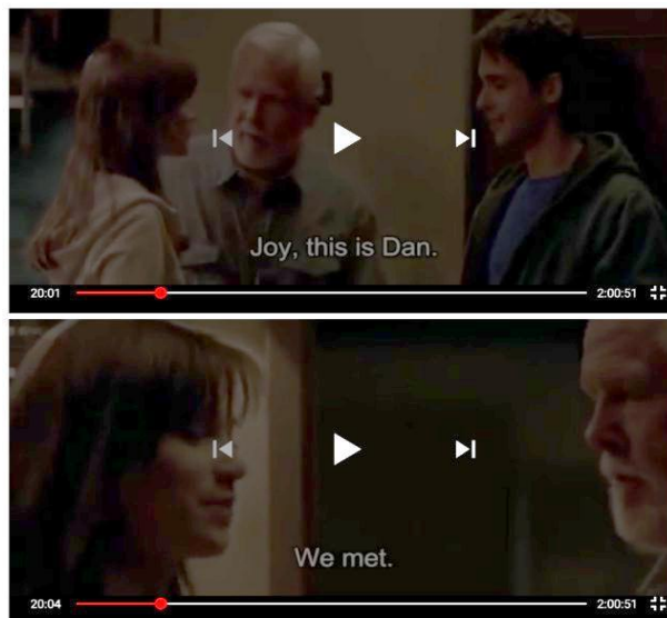
Figure 2. Scene in Dialogue 1

Based on the movie screen, The writer has found several implicature.