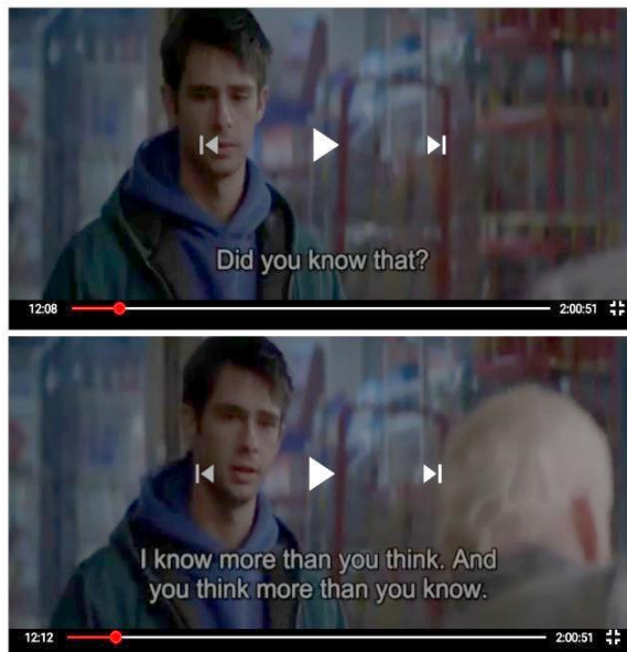
Figure 5. Scene in Dialogue 4