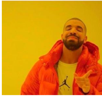
Figure 1.1: Drakeposting internet meme

“You used to call me on my cell phone, late night when you need my love, and I know when that hotline bling, that can only mean one thing.” “Be a good girl, you was in the zone.”