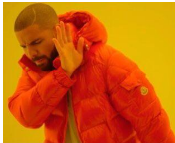
Figure 1.2: Drakeposting internet meme

In 1.1, Drake is moves his head forward as the direction of a person or other subject indicates interest. It can be interpreted when society agree on the idea of direct pointing as a sign of interest. Meanwhile, exposing the neck is also a sign of trust. When people feel free and safe, they tend to show themselves to others. Exposing the neck may be indicated that Drake puts his trust. Adding to the ideas, his hand looks like pointing as if he refers to something. In this case, Drake does not talk with anyone but the blank panel next to it that could be filled by anything the editor wants to. Yet if 1.1 put after the verses, it is understood that Drake is actually visualize how he likes the time when his ex was calling him and also being a good girl.