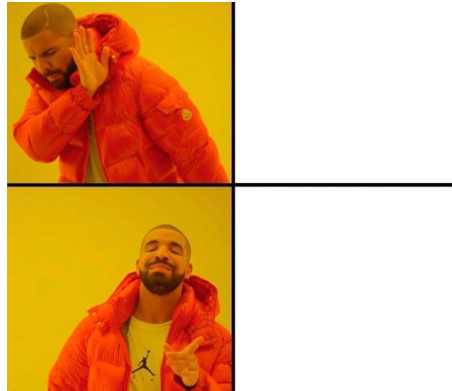
Figure 1: Drakeposting internet meme (source: knowyourmeme.com)

Drakeposting is a meme which was first published in a meme platform, 4chan. This meme contains two expressions of Drake that were taken from his music video, Hotline Bling . Drake is a Canadian rapper who already debuted from 2010. According to Billboard, Hotline Bling was becoming his best rap song. The song itself is about a man who is disappointed about his ex-girlfriend's attitudes towards him after being abandoned. The man represents his disappointment through words which told about how his ex is doing right after he left.